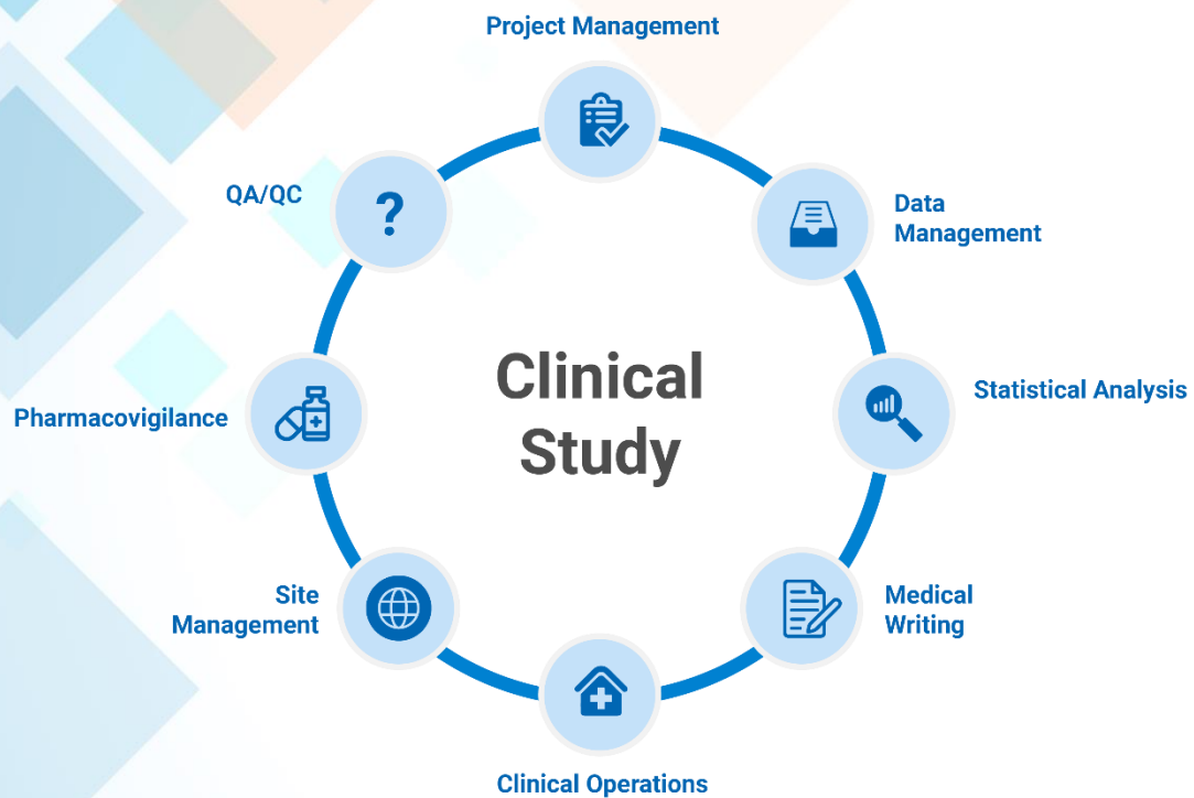
Fig.1. CTMS Scopes